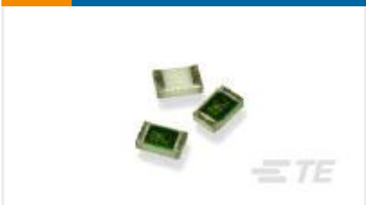
TE Part # 8-1879208-9 CPF 0402 47K 0.1% 25PPM 1K RL