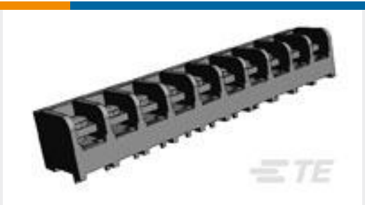
TE Part # 3-1437653-5 6PCV-10-006=6PCV ASSEMBLY