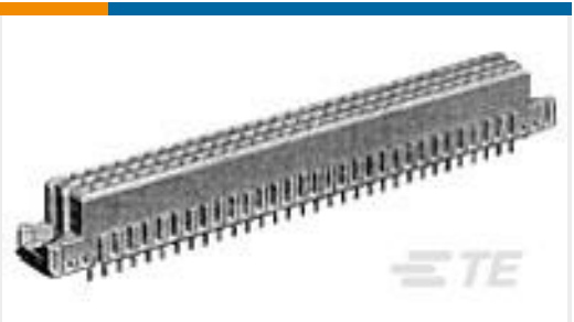
TE Part # 5650458-5 ASSEMBLY,RECEPTACLE,EURO,TYPE