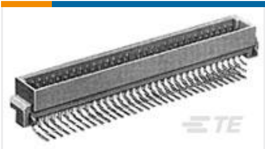
TE Part # 5650945-5 ASSY,PIN,EUROCARD,TYPE C,LEAD-