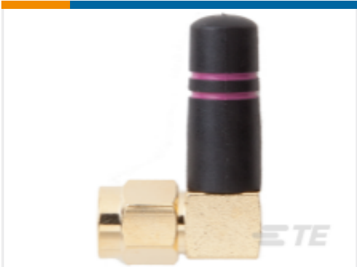
TE Part # L9000025-01 Antenna 1/4 Wave R-Angle 2.4GHz RPS