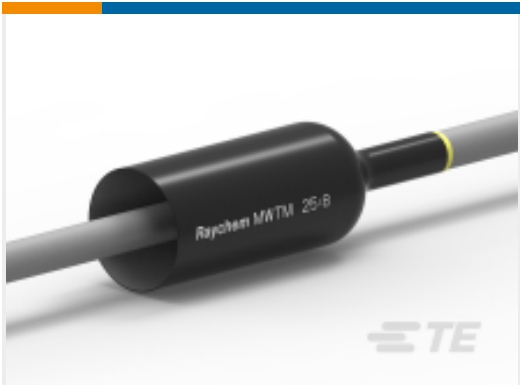
TE Part #455216-000 MWTM-25/8-1000/S