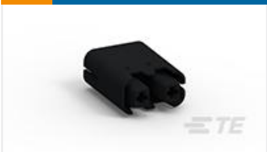
TE Part #1587977-2 INNER HOUSING, PLUG, HVA280-2PHM, PASS T