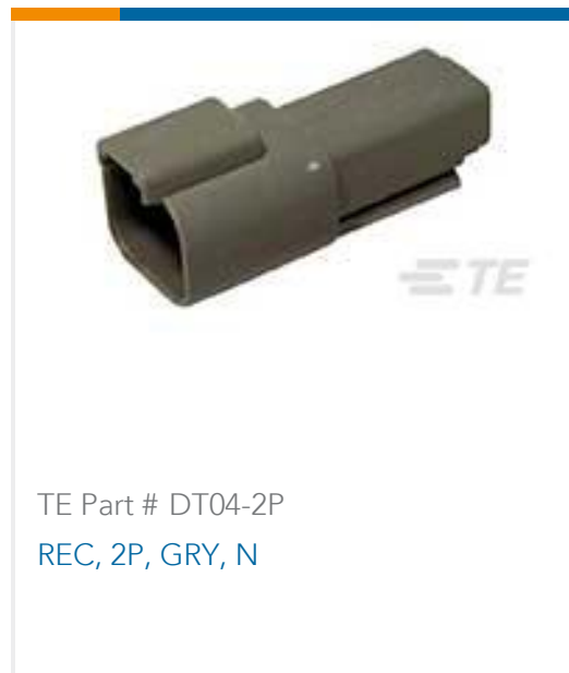
TE Part # DT04-2P REC, 2P, GRY, N