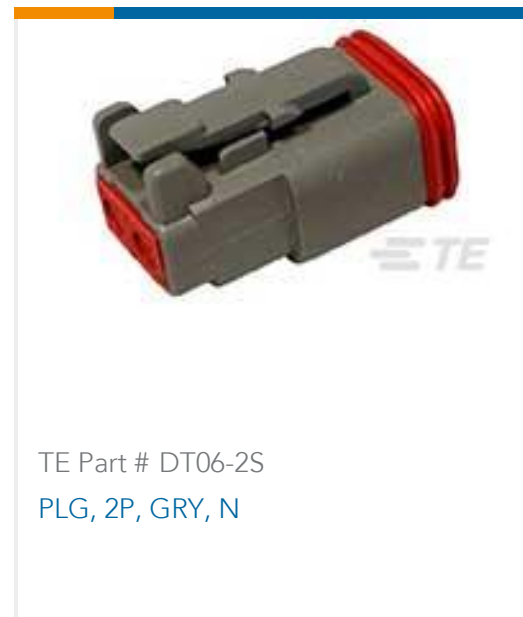
TE Part # DT06-2S PLG, 2P, GRY, N