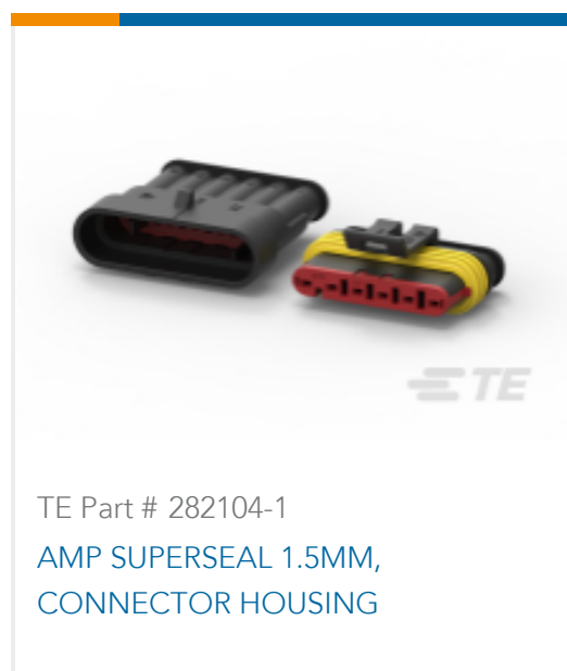
TE Part # 282104-1 AMP SUPERSEAL 1.5MM, CONNECTOR HOUSING