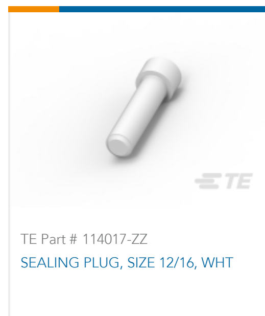
TE Part # 114017-ZZ SEALING PLUG, SIZE 12/16, WHT