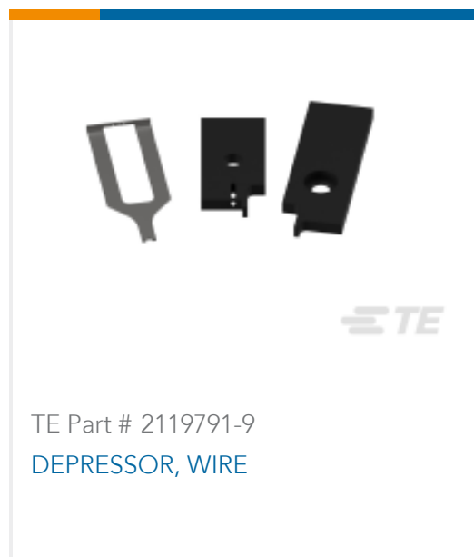
TE Part # 2119791-9 DEPRESSOR, WIRE