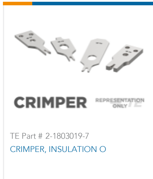
TE Part # 2-1803019-7 CRIMPER, INSULATION O