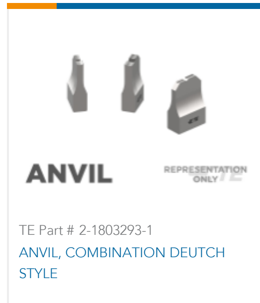
TE Part # 2-1803293-1 ANVIL, COMBINATION DEUTCH STYLE