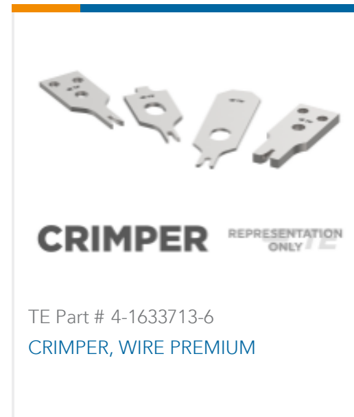
TE Part # 4-1633713-6 CRIMPER, WIRE PREMIUM