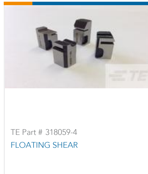
TE Part # 318059-4 FLOATING SHEAR