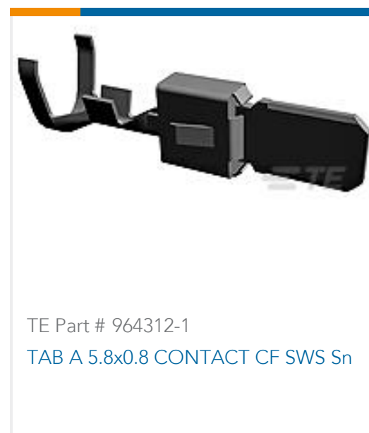
TE Part # 964312-1 TAB A 5.8x0.8 CONTACT CF SWS Sn