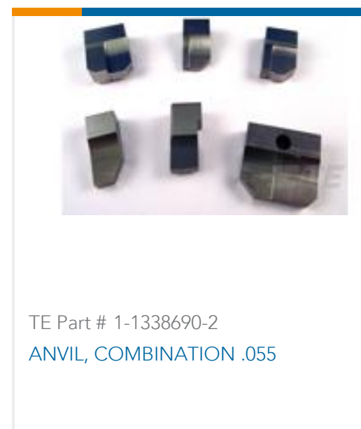
TE Part # 1-1338690-2 ANVIL, COMBINATION .055