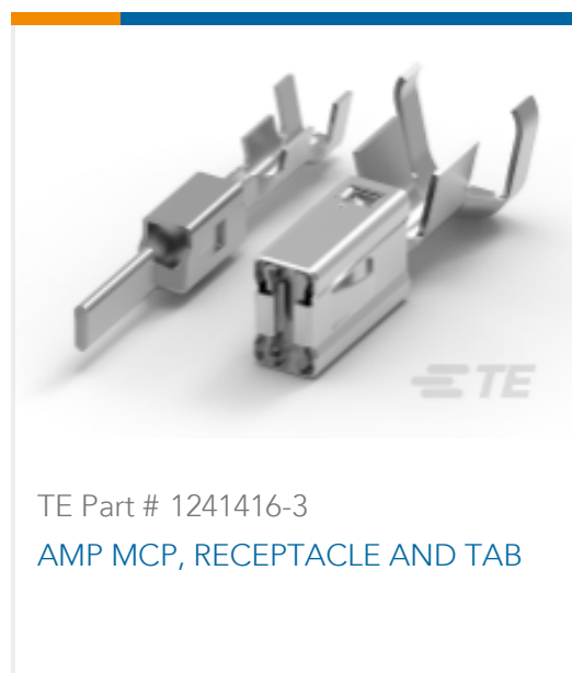
TE Part # 1241416-3 AMP MCP, RECEPTACLE AND TAB