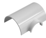
Box Adaptor Tee For use with D-Line Surface Socket Boxes. 2" x 1" only