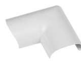
Door Top Bend Change direction by 90° around frame tops.