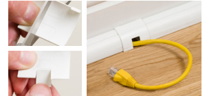
Use with Smooth-Fit Couplers & End Caps