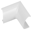
Internal Bend Join lengths around 90° inside corners.