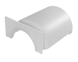
Flat Adaptor Connect Mini Raceway to flat surfaces 1.18" x 0.59" only