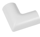
Flat Bend Change direction by 90° on flat surfaces.