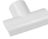
Equal Tee Use to join 3 lengths of same profile.