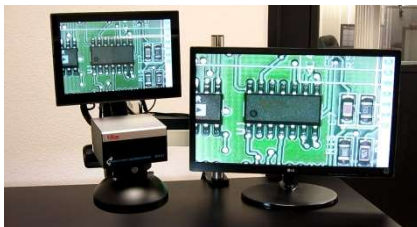
Dual screen output with an video splitter (not included)

The use of a digital microscope is becoming essential as the components gets smaller to accommodate more parts on a PCB surface. The new digital microscope enables users to improve quality and increase output efficiency while being ergonomic. The DM-S7 is ideal for first article inspections, all electronic printed circuit board inspections, CNC industrial applications, medical, and aerospace applications. Every aspect of use has been taken into account during the design process, providing an effortless user experience across all industries and increased user comfort. The DM-S7 includes the 10.1 Capacitive Touch Screen high resolution display, sturdy articulating arm, diffused dome light, and 8GB USB thumb drive.