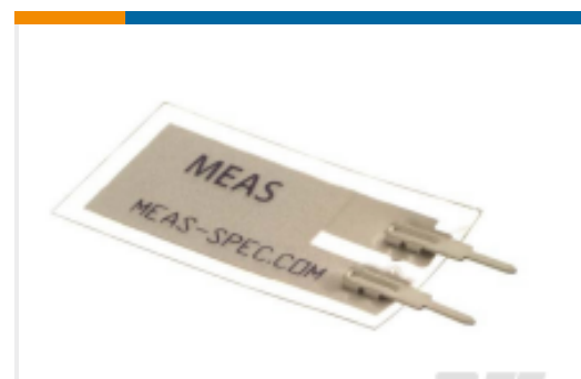
TE Part # 11026275-00 DT1-028K N/TH N/HOLE