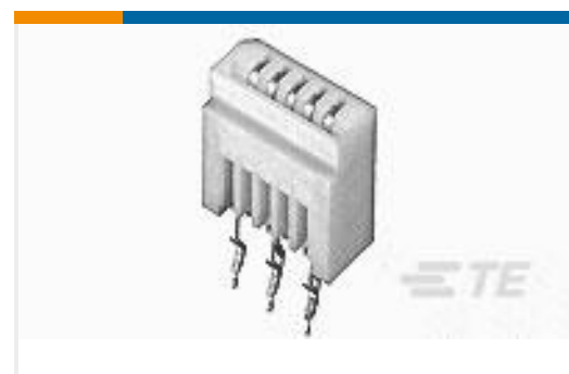
TE Part # 1-84984-2 1mm FFC DIP V ASSY 12P TUBE