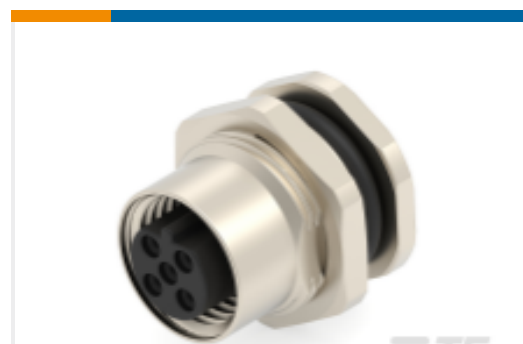
TE Part # T4131412041-000 M12,REAR MOUNT,FEMALE,B,4P, SOLDER WIRE