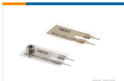
TE Part # 11026911-00 Piezo Vibration and PVDF Sensors