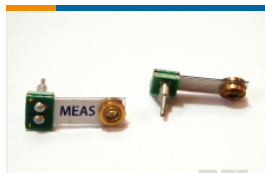
TE Part # 1005940-1 High Sensitivity Vibration Sensor