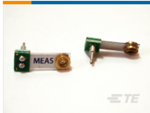
TE Part # CAT-PFS0011 High Sensitivity Vibration Sensor