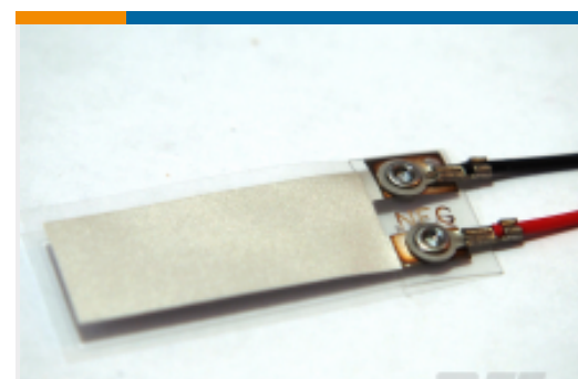
TE Part # 11028414-00 LDT1-028K W/TH LEADS/RIVE