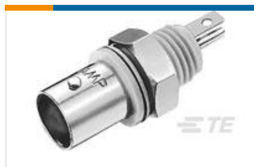
TE Part # 5227726-2 ISOLATED BNC SOLDER JACK ASSY