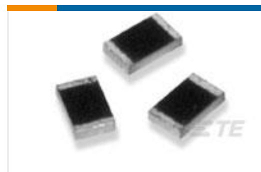
TE Part # 5-1879264-8 RP 2B 100K 0.1% 15PPM CUT LENGTH