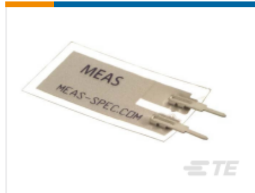
TE Part # 11026275-00 DT1-028K N/TH N/HOLE