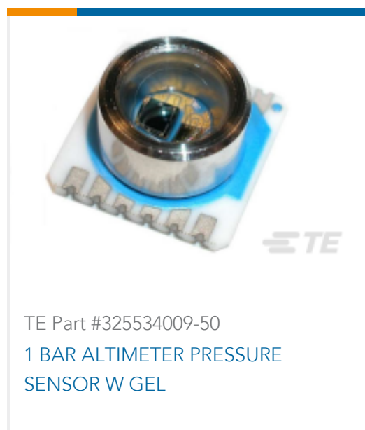
TE Part #325534009-50 1 BAR ALTIMETER PRESSURE SENSOR W GEL