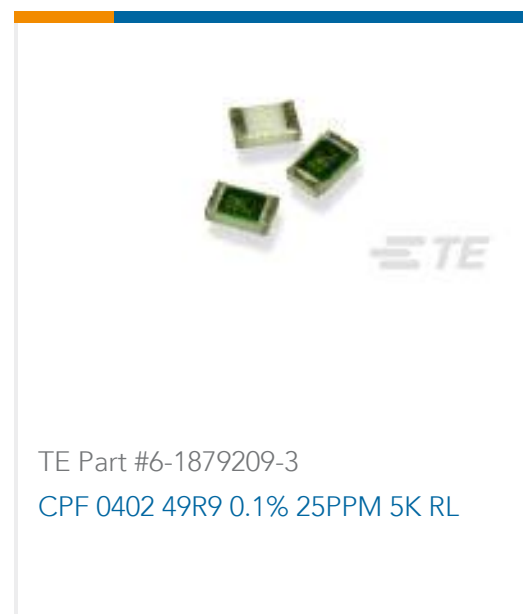
TE Part #6-1879209-3 CPF 0402 49R9 0.1% 25PPM 5K RL