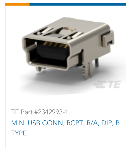
TE Part #2342993-1 MINI USB CONN, RCPT, R/A, DIP, B TYPE