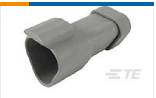
TE Part # DT04-3P-P006 REC, 3P, GRY, 120 OHM RESISTOR