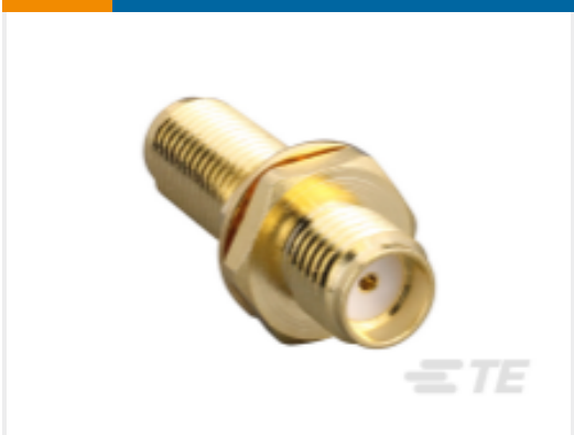
TE Part # ADP-SMAF-SMAF-B-G SMA Jack to SMA Jack Bulkhead