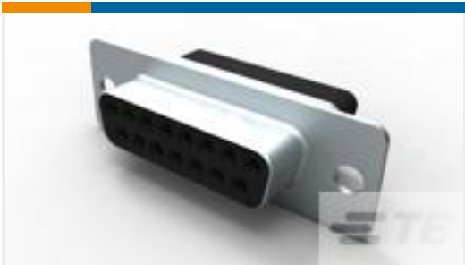
TE Part # 205205-7 CRIMP SNAP RCPT ASSY,SIZE 2