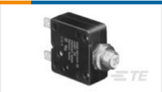
TE Part # 4-1393249-5 W58-XC4C12A-3=W58