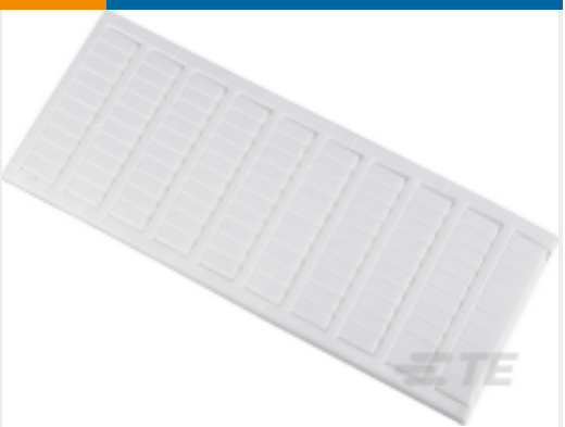
TE Part # 1SNK157052R0000 MC612PA 5 (x100) Vertical