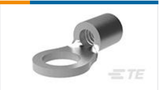
TE Part # 33459 TERMINAL,SOLIS R 12-10 5/16