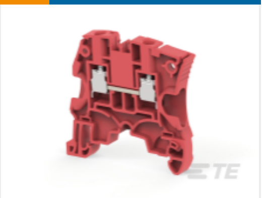
TE Part # 1SNK506062R0000 ZS6-RD