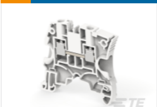
TE Part # 1SNK506065R0000 ZS6-WH