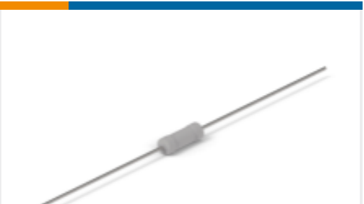
TE Part # 1-1676123-9 1/2W SM M/OX 5% 4R7