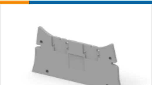
TE Part # 1SNK508910R0000 ES10-ST