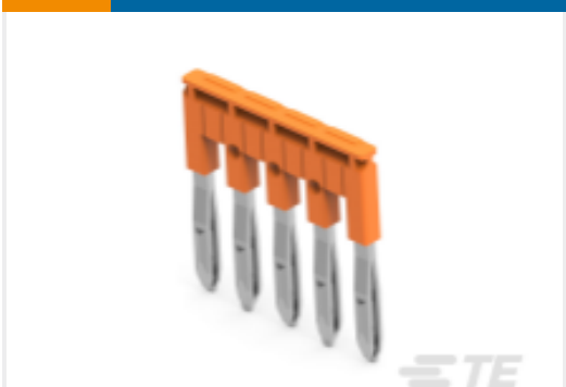
TE Part # 1SNK906305R0000 JB6-5