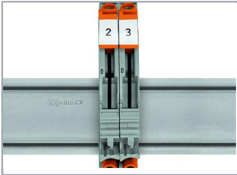
Preparing shorting path for the current transformer circuits.