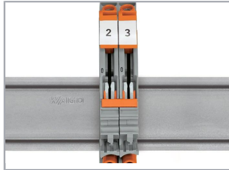
Insert insulated, touch-proof circuit jumpers into jumper slot.