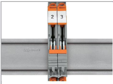
Insert insulated, touch-proof circuit jumpers into jumper slot.