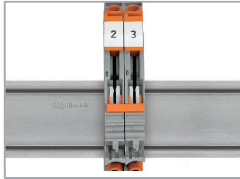
Insert insulated, touch-proof circuit jumpers into jumper slot.