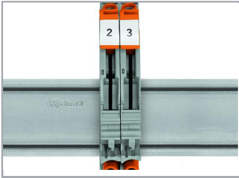
Preparing shorting path for the current transformer circuits.