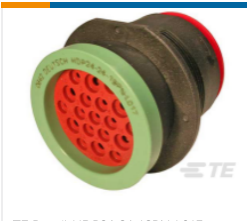
TE Part # HDP24-24-19PN-L017 REC, 19P, BLK, N, RNG, 12/16, P