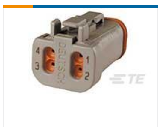
TE Part # DT06-4S-EP04 PLG, 4P, GRY, N, CAP