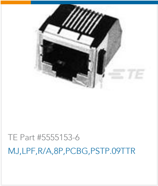
TE Part #5555153-6 MJ,LPF,R/A,8P,PCBG,PSTP.09TTR