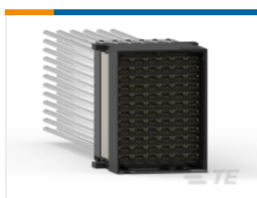
TE Part # 6-2320907-6 C/A,12P6C 100 OHM PIR CBL STRADA WHISPER