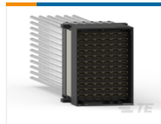
TE Part # 3-2320907-6 C/A,12P6C 100 OHM PIR CBL STRADA WHISPER