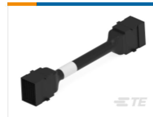
TE Part # 5-2320907-6 C/A,12P6C 100 OHM PIR CBL STRADA WHISPER