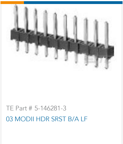
TE Part # 5-146281-3 03 MODII HDR SRST B/A LF