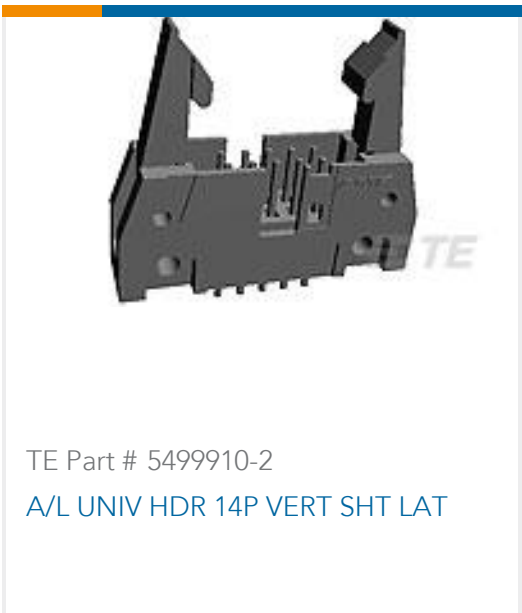
TE Part # 5499910-2 A/L UNIV HDR 14P VERT SHT LAT