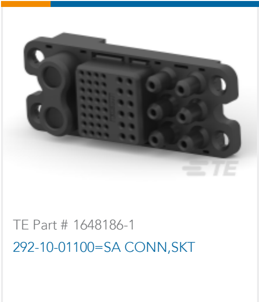
TE Part # 1648186-1 292-10-01100=SA CONN,SKT