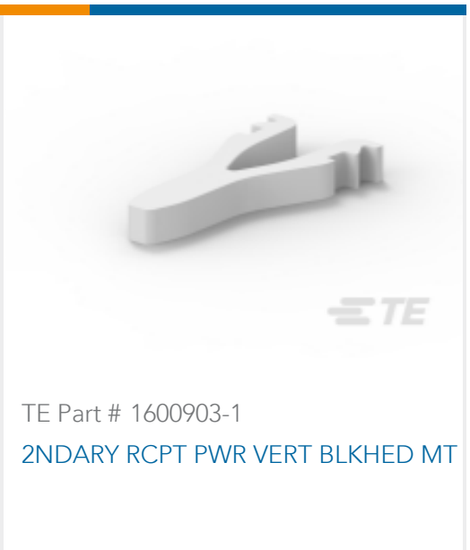
TE Part # 1600903-1 2NDARY RCPT PWR VERT BLKHED MT