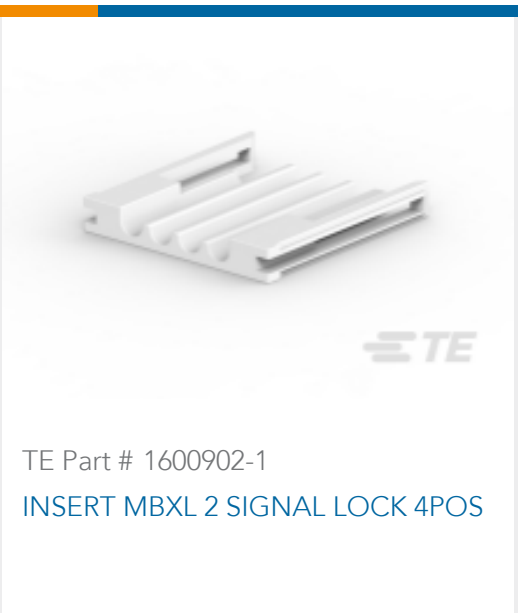
TE Part # 1600902-1 INSERT MBXL 2 SIGNAL LOCK 4POS