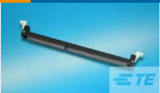
TE Part #1-1932000-7 VERTICAL DDR3 DIMM, 240 POSITION