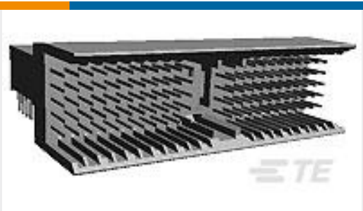
TE Part #6345055-1 Z-PACK/A RAMH.110P.