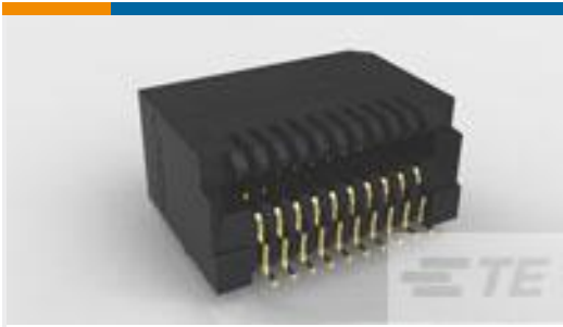
TE Part #1888247-1 20 POS SMT CONN, SFP/SFP+, 30A