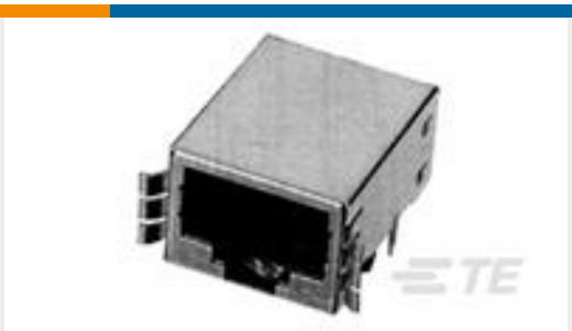
TE Part #1116062-2 MJ,10MM,8P,BEZEL PNL TABS,SN