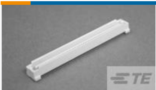
TE Part #5177986-3 0.8FH,P05H.5,080,08/Sn,TR,SC