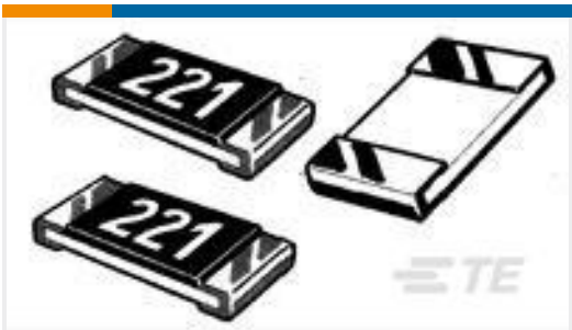
TE Part #6-2176231-5 3522 4K7 1% 3W