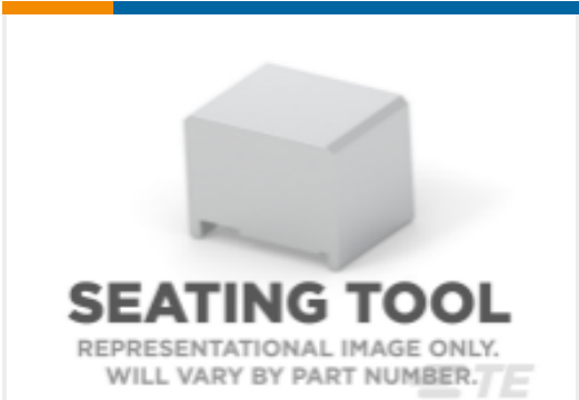
TE Part # 2018530-1 TOOL, SEAT 4 PR 10 COL,BP CONN