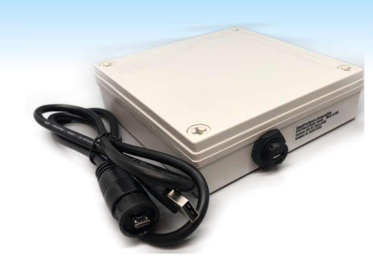
OPS7242 Radar Sensor