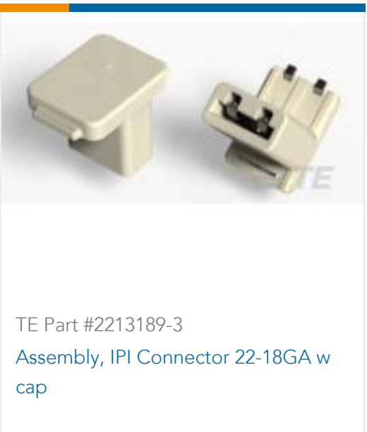
TE Part #2213189-3 Assembly, IPI Connector 22-18GA w cap