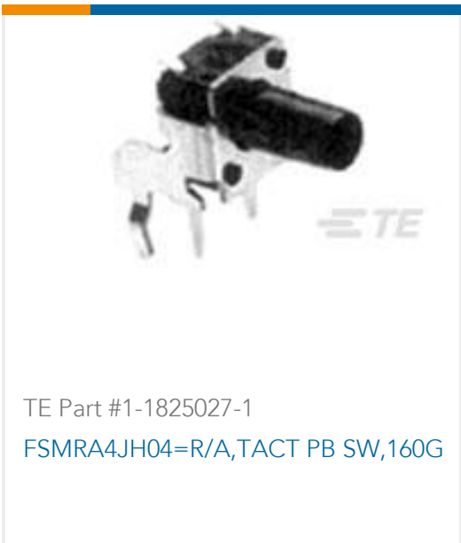
TE Part #1-1825027-1 FSMRA4JH04=R/A, TACT PB SW, 160G