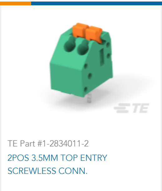
TE Part #1-2834011-2 2POS 3.5MM TOP ENTRY SCREWLESS CONN.