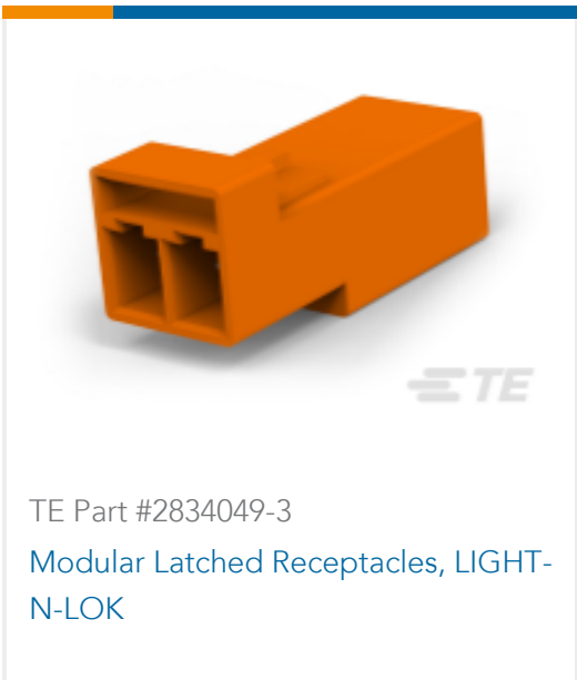
TE Part #2834049-3 Modular Latched Receptacles, LIGHT-N-LOK