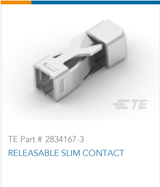
TE Part # 2834167-3 RELEASABLE SLIM CONTACT