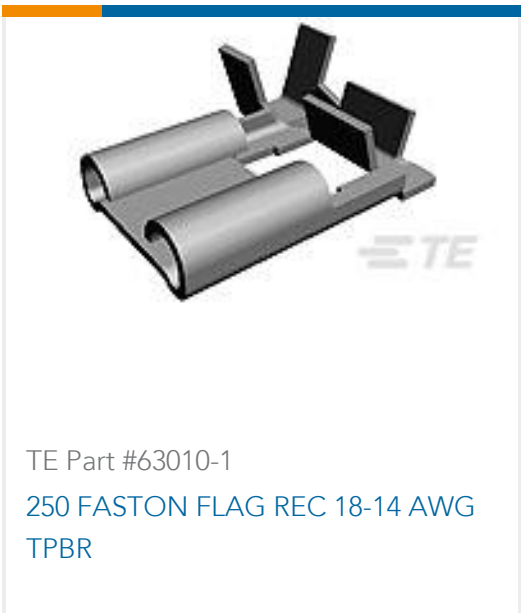
TE Part #63010-1 250 FASTON FLAG REC 18-14 AWG TPBR