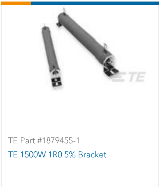
TE Part #1879455-1 TE 1500W 1R0 5% Bracket