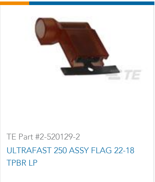
TE Part #2-520129-2 ULTRAFast 250 ASSY FLAG 22-18 TPBR LP