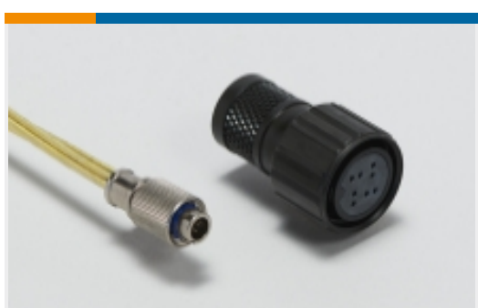
Standard Circular Connectors(124)