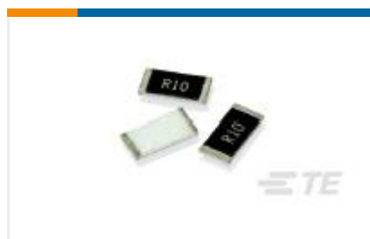
TE Part # 4-2176056-8 RLP73K 2B R91 5% 5K RL