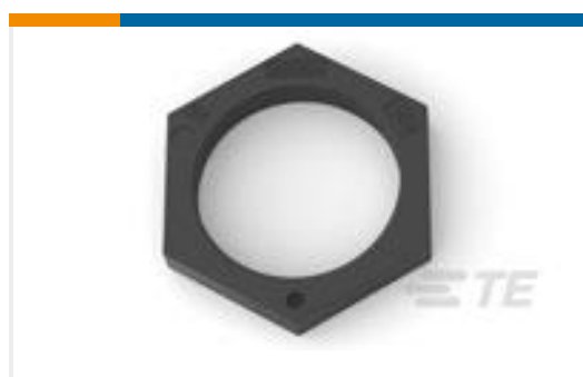
TE Part # 293708-1 NECTOR M SCREW NUT 5,6,7P