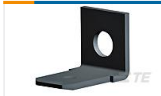
TE Part #141879-1 250 FASTON,TAB,BR