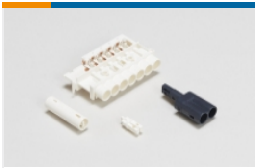
Plug & Socket Lighting Connectors(33)