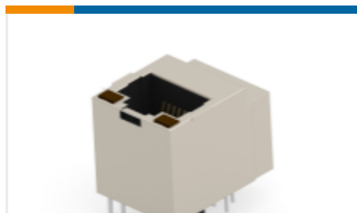
TE Part #203346-E MJIM IMV 1X1 S 810 * X R THRU * L9A M5B0