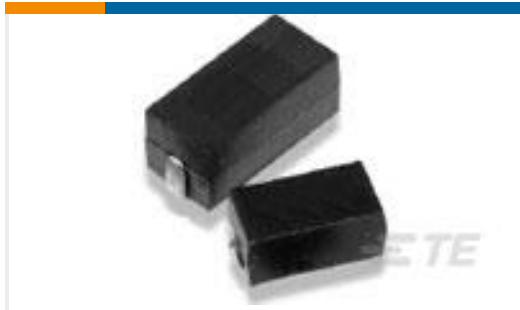
TE Part #8-1879233-1 SMW5 220R 5%