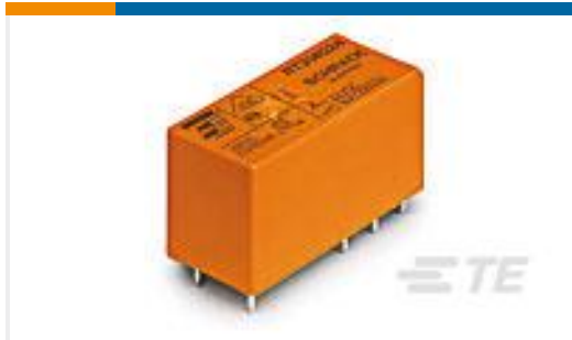
TE Part #6-1393243-8 RT424024