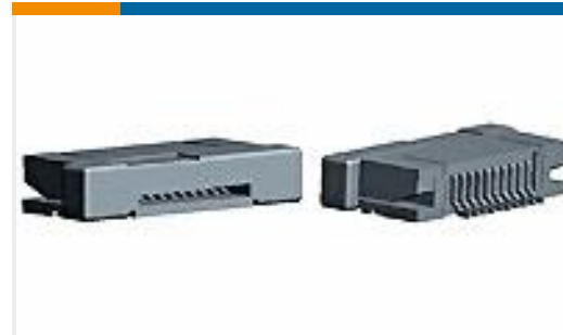
TE Part #3-1734592-1 FPC CONN. 0.5MM PITCH B/C, 31P