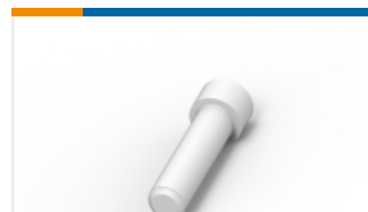
TE Part # 114017-ZZ SEALING PLUG, SIZE 12/16, WHT