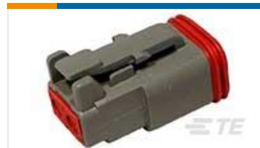
TE Part # DT06-2S PLG, 2P, GRY, N