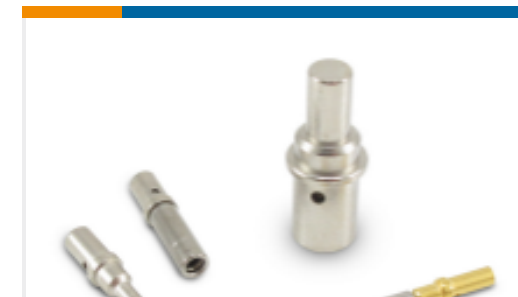
TE Part # 0460-202-16141 DEUTSCH Solid Contacts