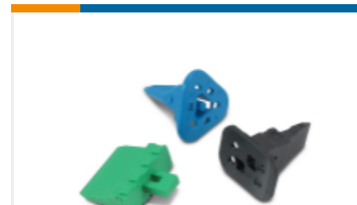
TE Part # W2S Wedgelocks: DEUTSCH DT