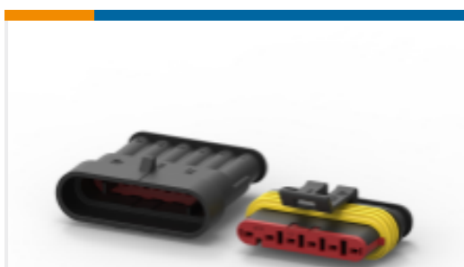
TE Part # 282104-1 AMP SUPERSEAL 1.5MM, CONNECTOR HOUSING