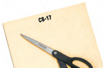
(SCISSORS NOT INCLUDED)

CS-17/625 —1 sheet, 8.5" x 17" x 1" thick