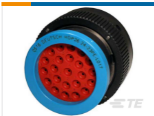
TE Part #HDP26-24-23PE-L017 PLG, 23P, BLK, E, RNG, 16, P