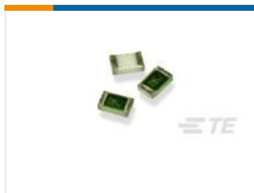
TE Part #3-1879216-5 CPF0402 200K 0.1% 25PPM 1K RL