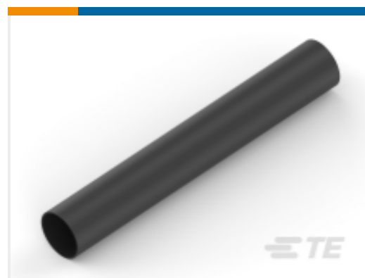
TE Part #NB11242001 ATUM-40/13-0-STK