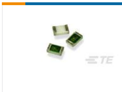
TE Part #3-1879216-2 CPF0402 150K 0.1% 25PPM 1K RL