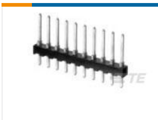
TE Part #87224-4 04 MODII HDR SRST UNSHRD .100