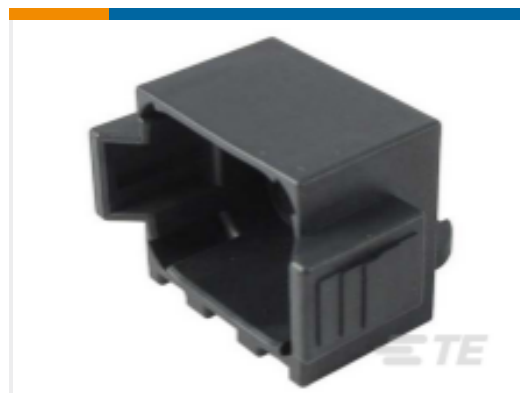
TE Part #1011-348-0805 DUST CAP, 8P, PLG, BLK, DT