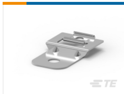
TE Part #1027-017-1200 CLIP, STEEL, ZINC, 8.2MM HOLE, SIDE