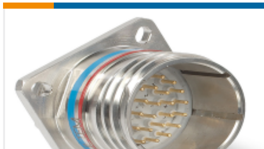
TE Part # YDTS20F25-19PBV001 RECP ASSY