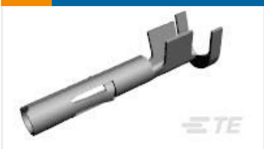
TE Part # 350919-3 UMNL SOK 18-14 PTPPHBZ