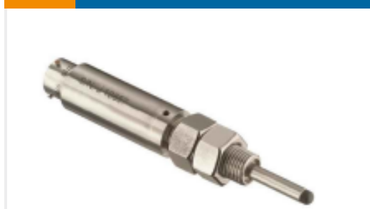
TE Part # 02351008-000 GA-HD GCD-SE-500 ASSY