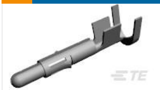
TE Part # 350918-3 UMNL PIN 18-14 PTPPHBZ