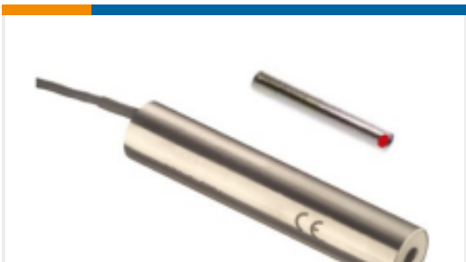
TE Part # 02560992-000 LVDT DC-SE 500