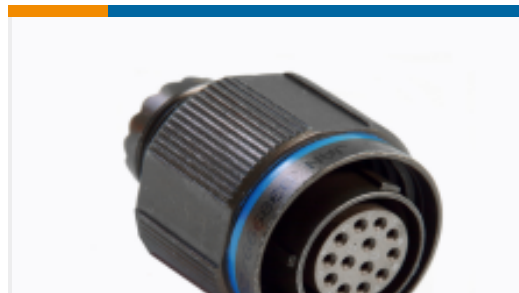
TE Part # YDTS26F23-35SAV001 PLUG ASSY