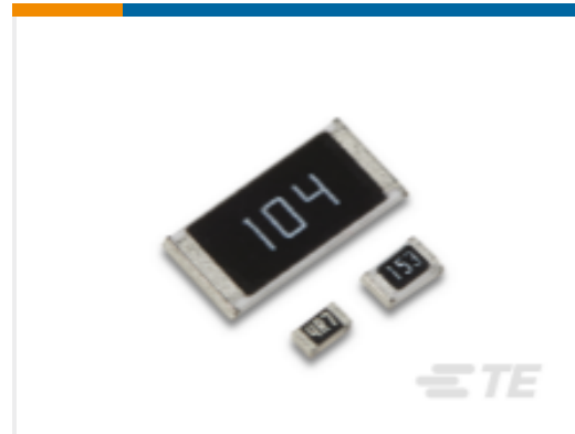
TE Part # 3-2176337-2 CRGCQ 0402 3K9 1%