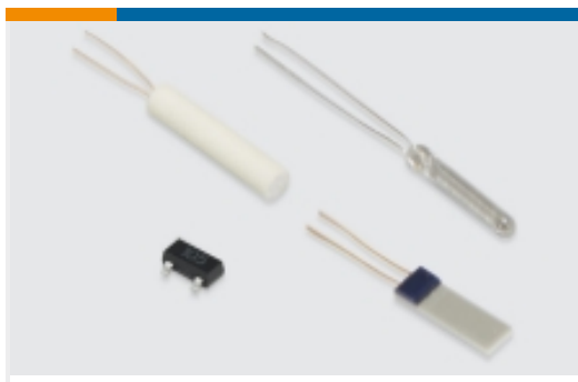
RTD Sensor Elements(6)