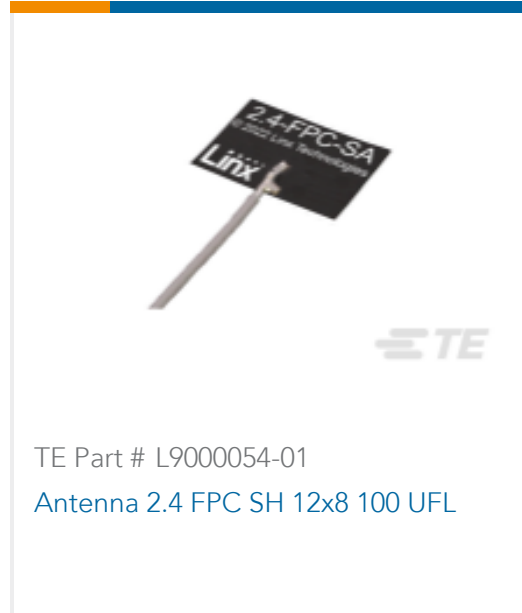
TE Part # L9000054-01 Antenna 2.4 FPC SH 12x8 100 UFL