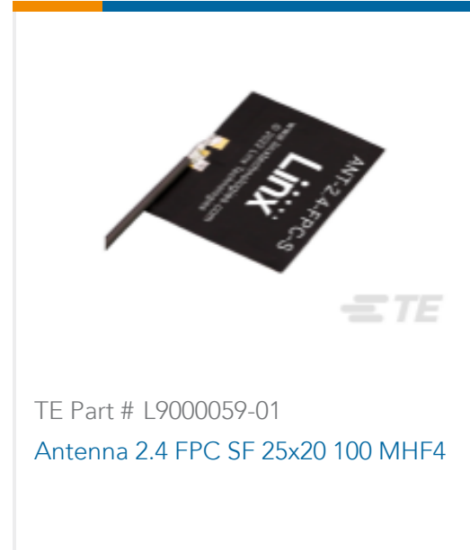
TE Part # L9000059-01 Antenna 2.4 FPC SF 25x20 100 MHF4