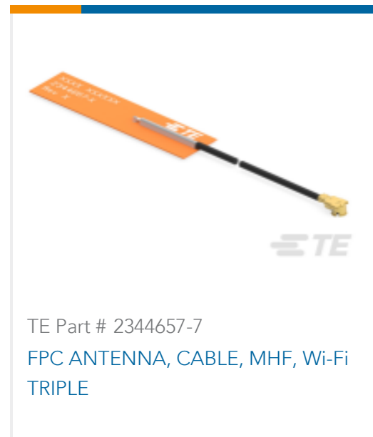
TE Part # 2344657-7 FPC ANTENNA, CABLE, MHF, Wi-Fi TRIPLE