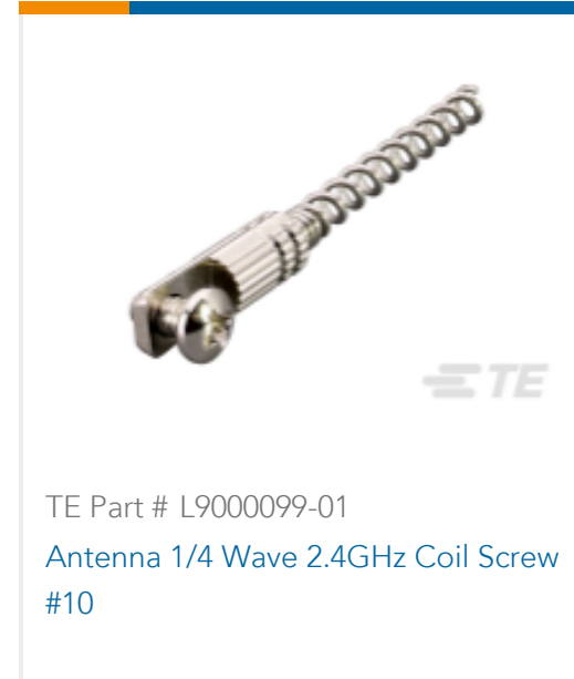
TE Part # L9000099-01 Antenna 1/4 Wave 2.4GHz Coil Screw #10