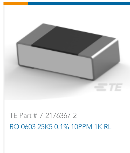
TE Part # 7-2176367-2 RQ.0603 25K5 0.1% 10PPM 1K RL