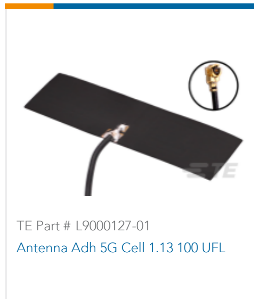
TE Part # L9000127-01 Antenna Adh 5G Cell 1.13 100 UFL