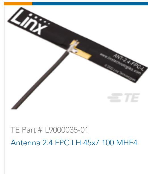
TE Part # L9000035-01 Antenna 2.4 FPC LH 45x7 100 MHF4