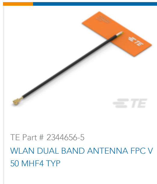
TE Part # 2344656-5 WLAN DUAL BAND ANTENNA FPC V 50 MHF4 TYP