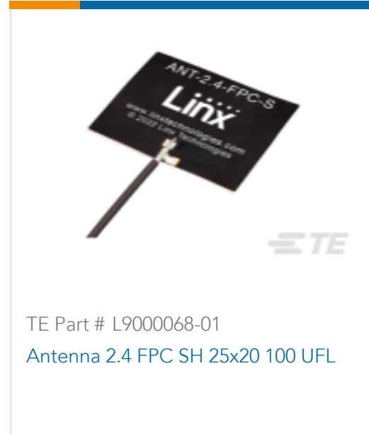
TE Part # L9000068-01 Antenna 2.4 FPC SH 25x20 100 UFL