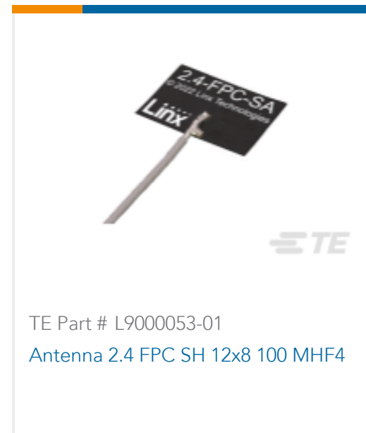
TE Part # L9000053-01 Antenna 2.4 FPC SH 12x8 100 MHF4