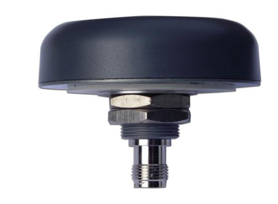
TW3972 Dimensions (mm)