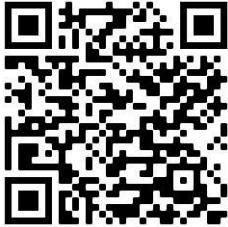
Android SolarMate App

SolarMate Mobile apps are available for Android and IOS devices. QR codes to receive the apps are as follows. Any mobile device with a barcode reader app should be able to read these codes.