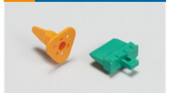
Automotive Connector Locks & Position Assurance(2)