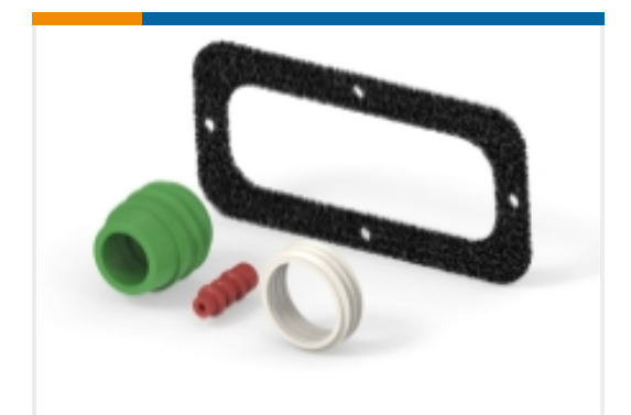
Connector Seals & Cavity Plugs(4)