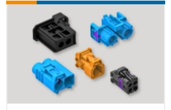
Data Connectivity Housings(3)