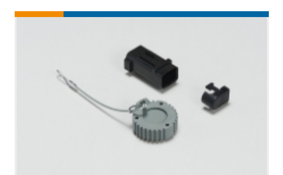
Automotive Connector Caps & Covers (3)