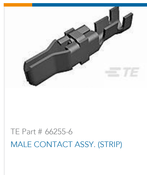
TE Part # 66255-6 MALE CONTACT ASSY. (STRIP)