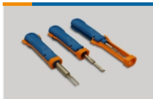
Insertion & Extraction Tools(3)