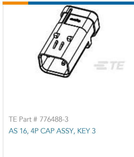
TE Part # 776488-3 AS 16, 4P CAP ASSY, KEY 3