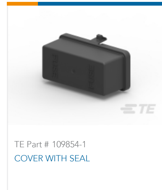
TE Part # 109854-1 COVER WITH SEAL