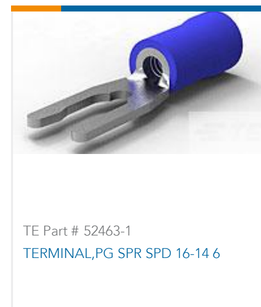
TE Part # 52463-1 TERMINAL,PG SPR SPD 16-14 6