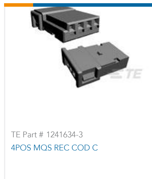
TE Part # 1241634-3 4POS MQS REC COD C