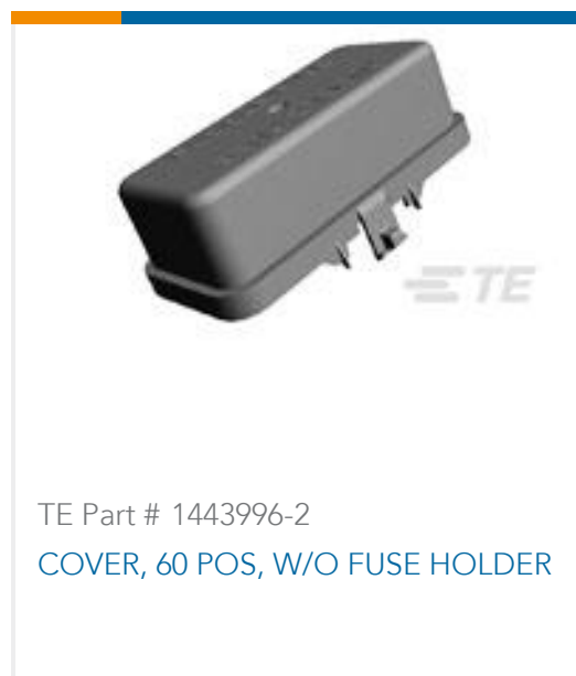
TE Part # 1443996-2 COVER, 60 POS, W/O FUSE HOLDER