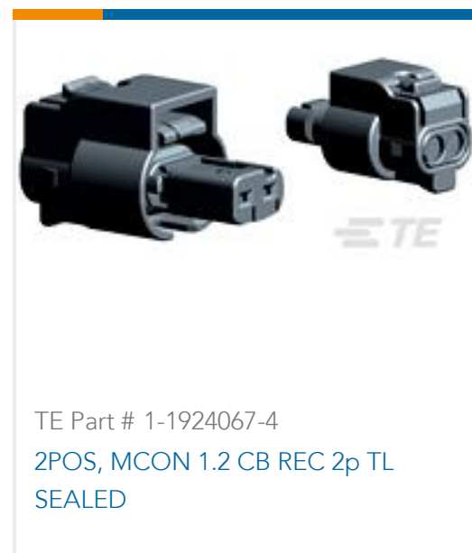
TE Part # 1-1924067-4 2POS, MCON 1.2 CB REC 2p TL SEALED