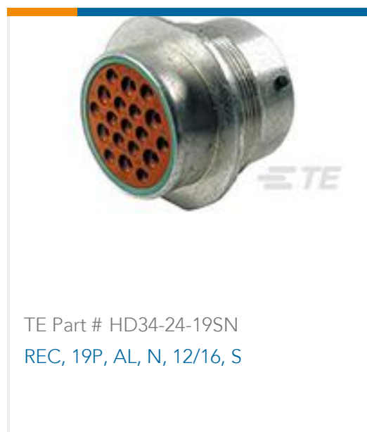
TE Part # HD34-24-19SN REC, 19P, AL, N, 12/16, S