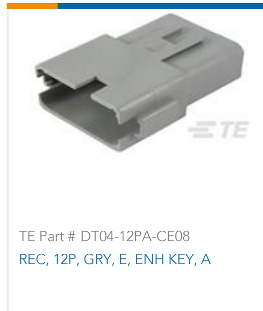
TE Part # DT04-12PA-CE08 REC, 12P, GRY, E, ENH KEY, A