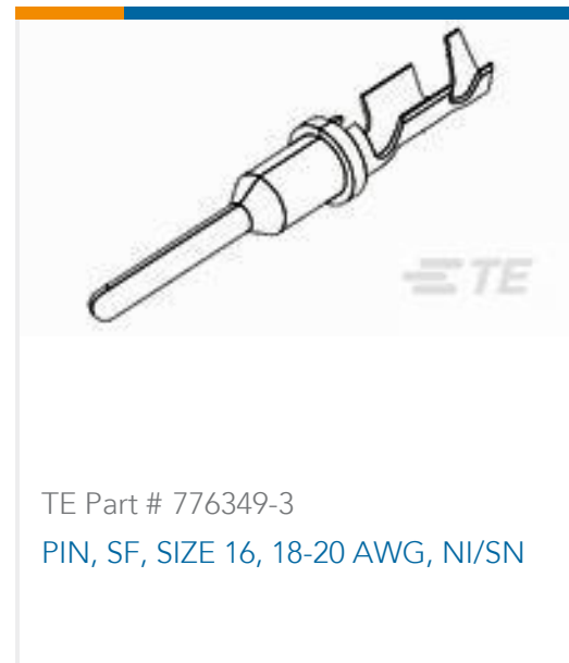
TE Part # 776349-3 PIN, SF, SIZE 16, 18-20 AWG, NI/SN