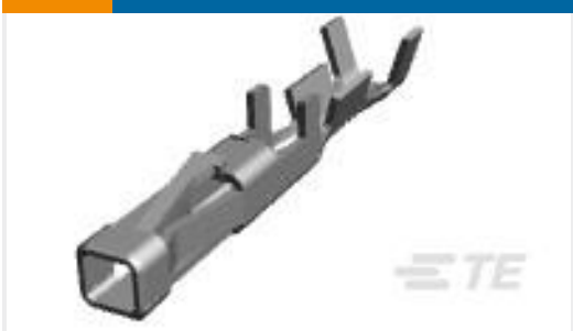
TE Part # 1-794611-1 MICRO MNL RPT CNT,LS PC,15AU,L