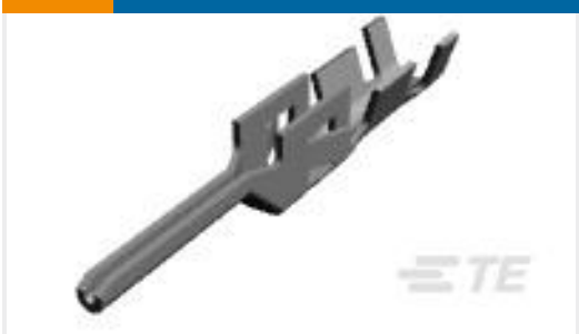
TE Part # 1-794612-1 PIN CONT 20-24 15 GOLD L/P