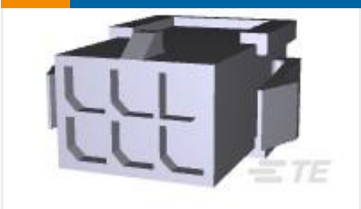
TE Part # 794615-6 PANEL MT DBL ROW HSG 6 POS