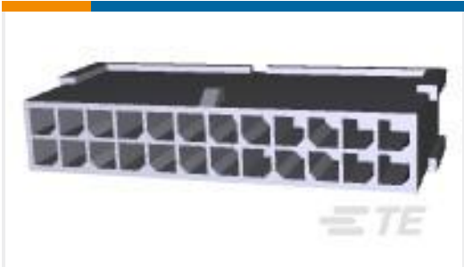
TE Part # 2-794616-4 FREE HANG DBL ROW HSG 24 POS