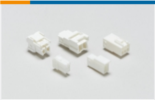
Rectangular Power Connectors(98)