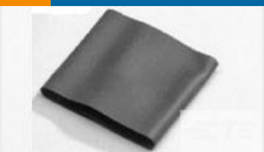
TE Part # 592387J001 V2-4.0-0-SP-SM