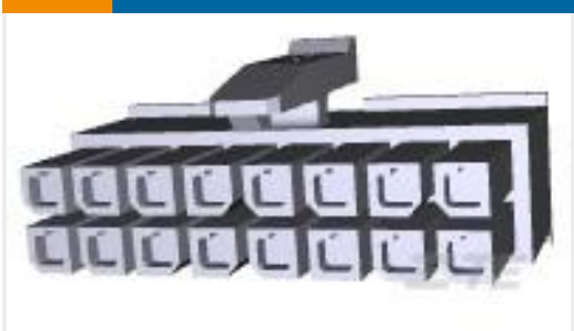
TE Part # 1-794617-6 16POS,MICRO MNL,RCPT HSG