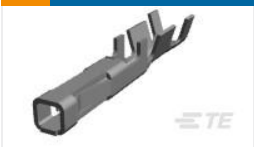
TE Part # 1-794610-1 MICRO MNL RPT CNT,LS PC 15AU L