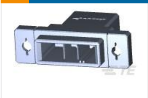
TE Part # 1-179553-3 DYNAMIC D-3200 WTW TAB HSG 3P