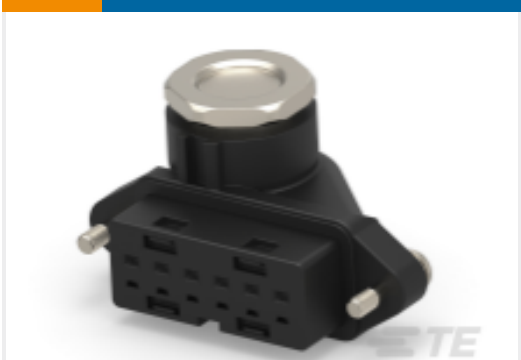
TE Part # 2345832-2 REC. KIT (CONT. ADD.) NEW MOTO. PF