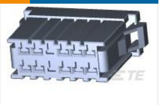
TE Part # 178289-6 DYNAMIC 3100 REC HSG 12P DBL