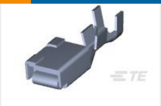
TE Part # 316040-6 DYNAMIC D-5 REC CONT S L/P