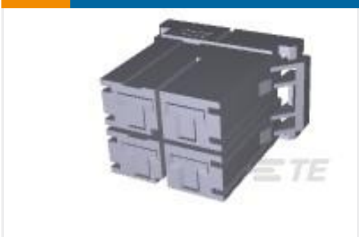
TE Part # 1-917807-2 DYNAMIC D-5200M REC HSG 4P X-X