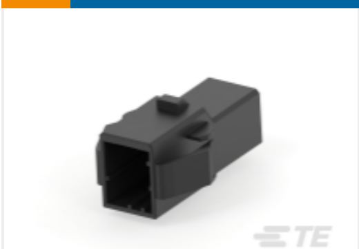
TE Part # 2-1318120-3 Receptacle and Tab Housing: 2.5 mm Pitch, 250V