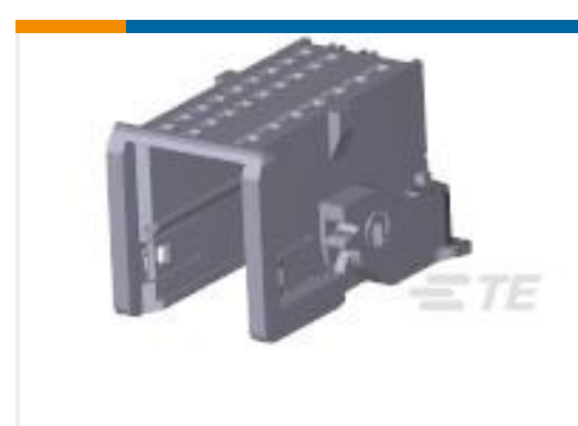
TE Part #1-1718484-4 CARRIER FOR RECEPTACLE INSERTS