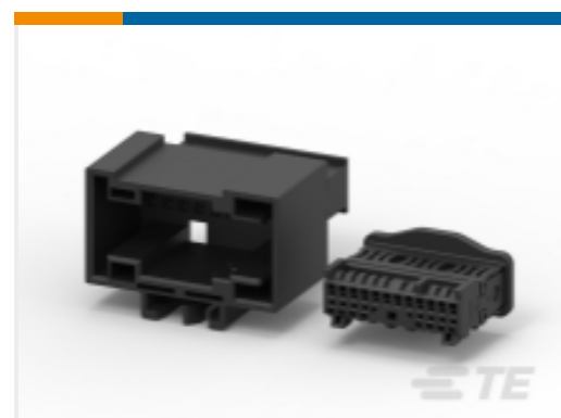
TE Part #3-1534904-2 MQS, CONNECTOR HOUSING