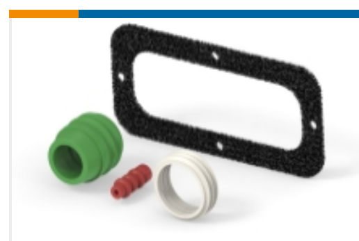
Connector Seals &amp; Cavity Plugs(5)