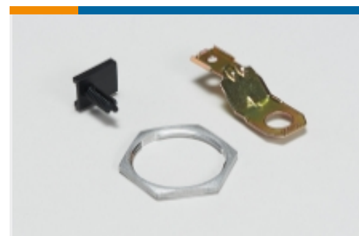
Other Automotive Connector Accessories(34)