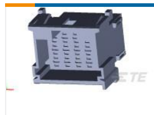
TE Part #3-967628-1 TAB HSG 2.8MM 15POS.