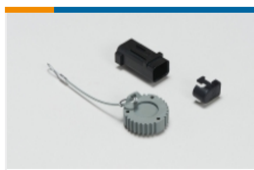
Automotive Connector Caps &amp; Covers (25)