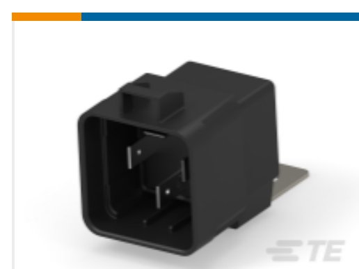
TE Part #3-1904131-0 V23134B4052X546-EV-CBOX