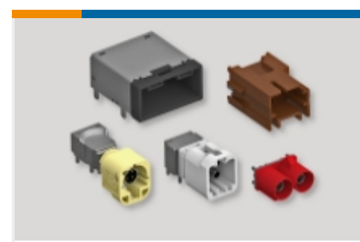
Data Connectivity Headers(2)