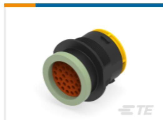
TE Part #HDP24-24-33PN-L017 REC, 33P, BLK, N, RNG, 20, P