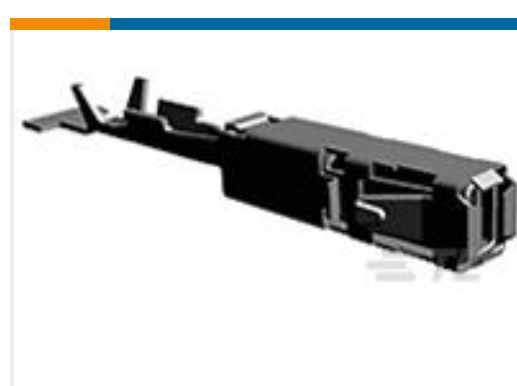
TE Part #1418884-1 AMP MCP 1.5K, CONTACT, SWS