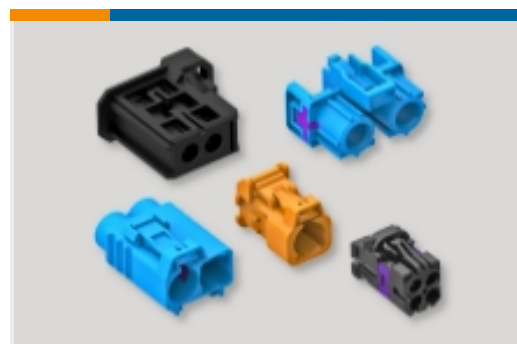
Data Connectivity Housings(16)