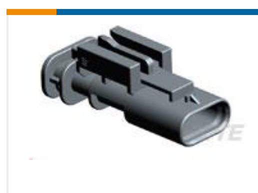
TE Part #2-1703494-2 3POS, MCON 1.2 LL TAB SEALED COD B