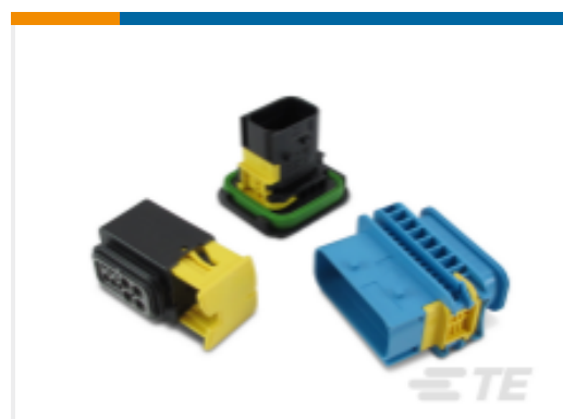
TE Part #1-1563759-1 Heavy Duty Sealed Connector Series Housings