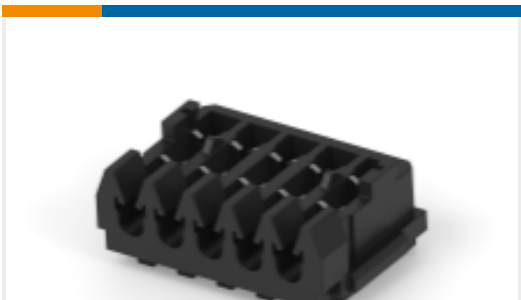
TE Part # 2-353293-5 1.5MM CT MT REC ASSY 5P BLACK