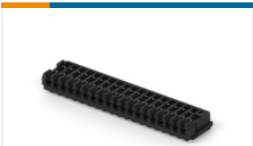
TE Part # 3-353293-9 1.5MM CT MT REC ASSY 19P BLACK