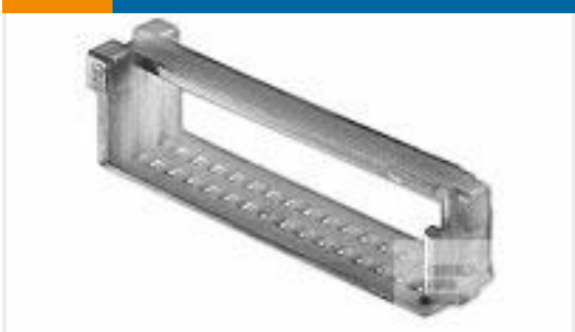
TE Part # 3-353294-4 AMP MINI D/R HDR HSG 34P NATU