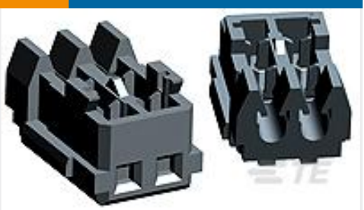
TE Part # 1-353293-5 1.5 MINI-CT RECEPTACLE