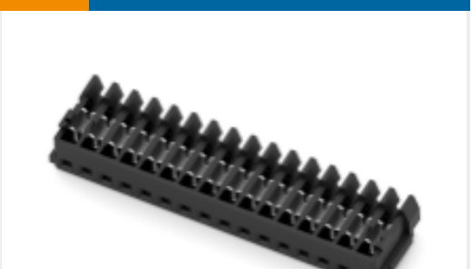
TE Part # 3-353293-6 1.5MM CT MT REC ASSY 16P BLACK