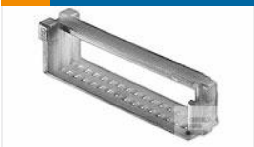
TE Part # 4-353294-0 AMP MINI D/R HDR HSG 40P NATU