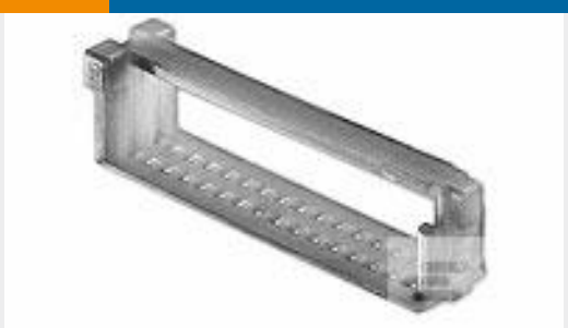
TE Part # 2-353294-8 AMP MINI D/R HDR HSG 28P NATU