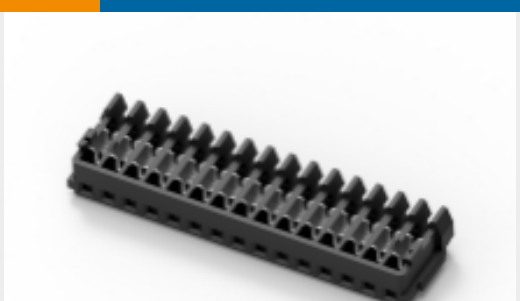
TE Part # 3-353293-5 1.5MM CT MT REC ASSY 15P BLACK