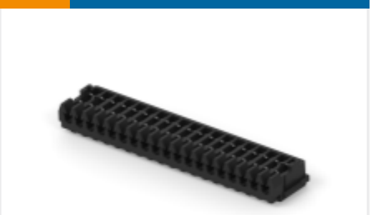
TE Part # 3-353293-9 1.5MM CT MT REC ASSY 19P BLACK