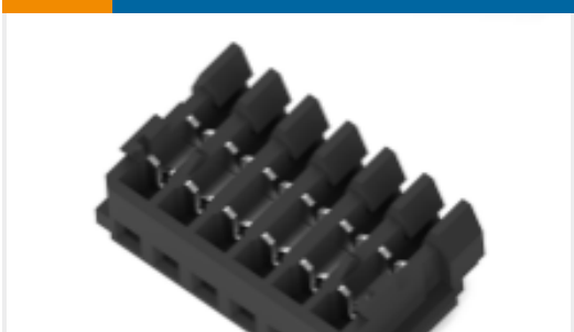
TE Part # 2-353293-6 1.5MM CT MT REC ASS'Y 6P BLACK