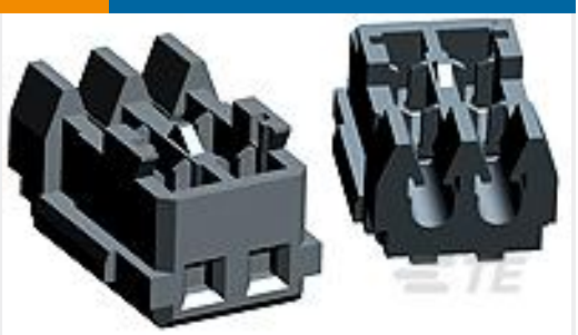
TE Part # 353293-3 MINI CT MT REC ASSY 3P GRAY