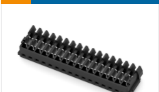
TE Part # 3-353293-6 1.5MM CT MT REC ASSY 16P BLACK