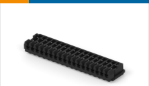
TE Part # 3-353293-8 1.5MM CT MT REC ASSY 18P BLACK