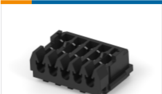
TE Part # 2-353293-5 1.5MM CT MT REC ASS'Y 5P BLACK