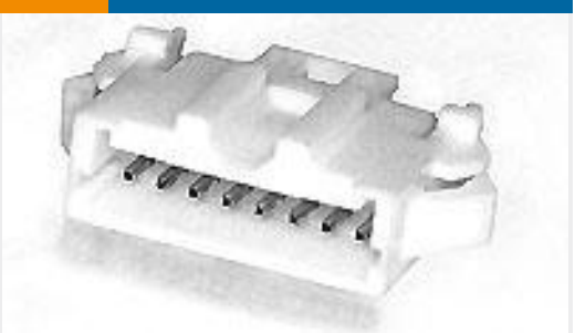
TE Part #292215-3 MINI CT SGL RELAY 3P NAT