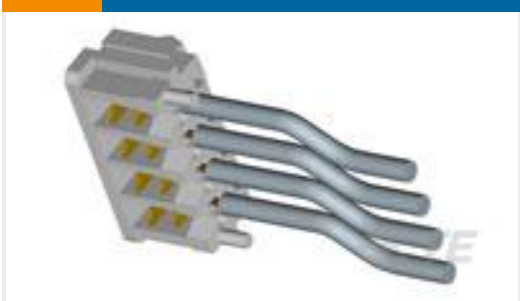
TE Part #173977-3 CT CONN MT REC ASSY 3P