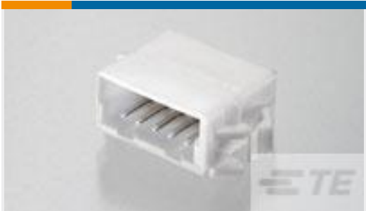
TE Part #292254-2 CT RELAY HDR ASSY 2P NAT