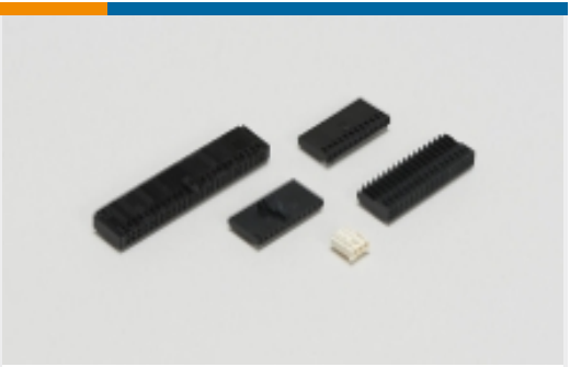
Wire-to-Board Connector Assemblies & Housings(255)