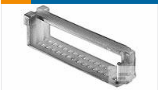
TE Part #3-353294-2 AMP MINI D/R HDR HSG 32P NATU