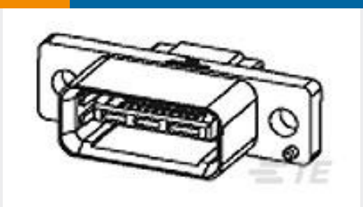
TE Part #3-292234-0 1.5 MINI CT DC DRAWER PLUG ASS