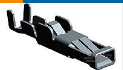
TE Part #179317-4 HYBRID MINI DRAWER REC CONT.#2