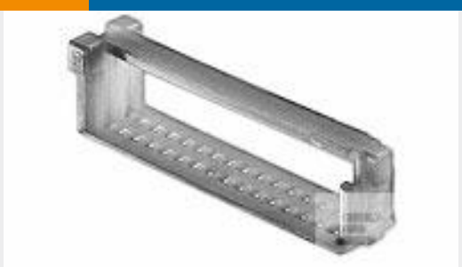
TE Part #2-353294-2 AMP MINI D/R HDR HSG 22P NATU