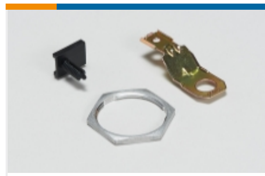
Other Automotive Connector Accessories(1)