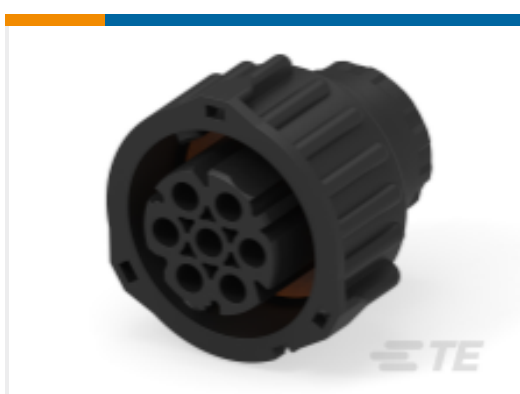
TE Part #1813344-1 7p 1.5mm socket housing assy' coding A