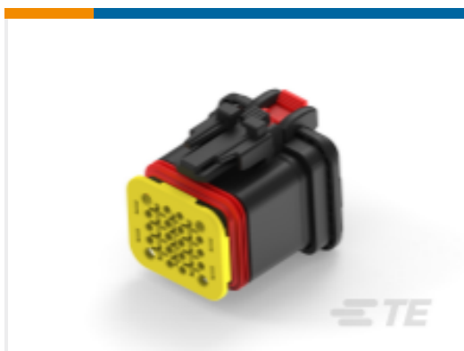
TE Part #2350890-1 20POS, HYBRID, SOC HSG ASSY, SLD, COD A