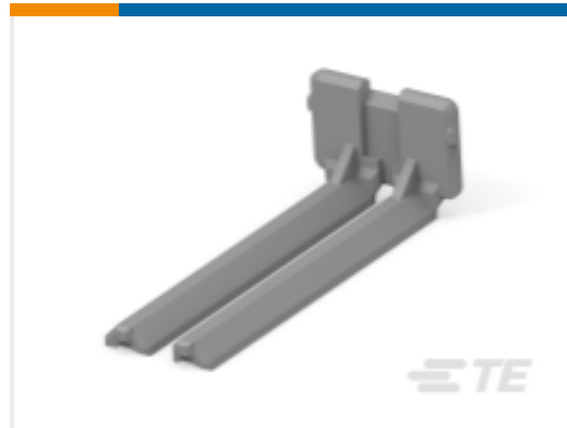
TE Part #2137354-1 SECOND LOCKING DEVICE, FOR AMP-MCP 18P