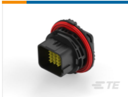
TE Part #2-2350891-1 20POS, HYBRID, PIN HSG ASSY, SLD, COD A