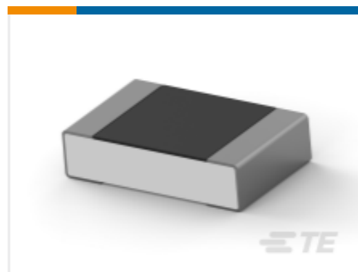
TE Part #2176374-2 RQ 0805 110R 0.1% 10PPM 1K RL