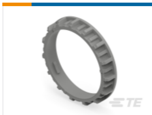
TE Part #2366517-2 FIX RING, CONN KIT