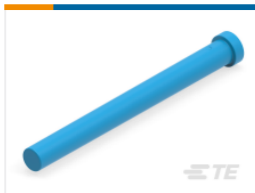
TE Part #2373921-3 CVTY PLUG, PIN DIA 2.5, CVTY DIA, 2.5, BLU