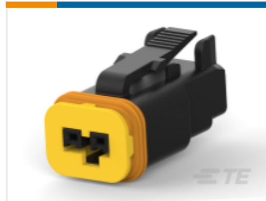
TE Part #2324808-1 2POS, MCON 1.2, REC HSG ASSY, SLD, COD A