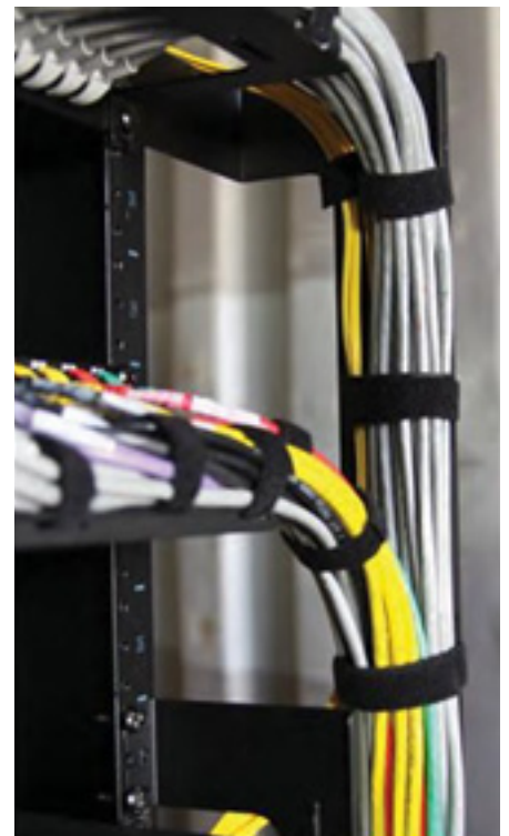
Vertical Cable Manager

So 18RU, rather than 36RU, are occupied for 864 ports. This same rack using 28AWG patch cords and A'n D Cable "ZeroU" RackOrganizers® with 1RU 48 port patch panels will hold another 864 ports.