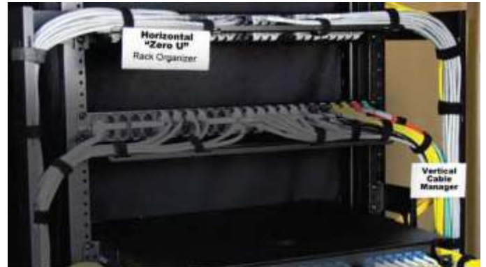
Horizontal "ZeroU" RackOrganizer® and Vertical Cable Manager

After optimization, only 49RU is occupied.