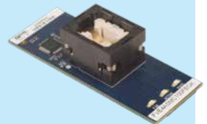
Compatible Programmers: 9th Gen, 7th Gen, 6th Gen