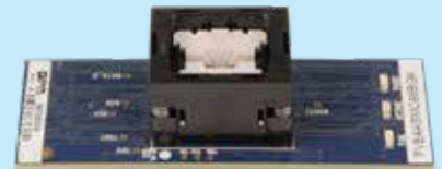
Compatible Programmers: 9th Gen, 8th Gen