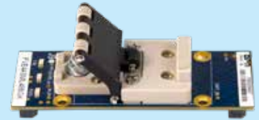
Compatible Programmers: 9th Gen, 8th Gen, 7th Gen, 6th Gen