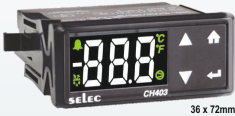
36 x 72mm