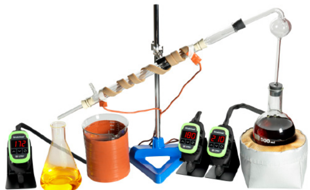
Heaters not included

Additional specifications for LYNX® can be found in BriskHeat product catalog or website.