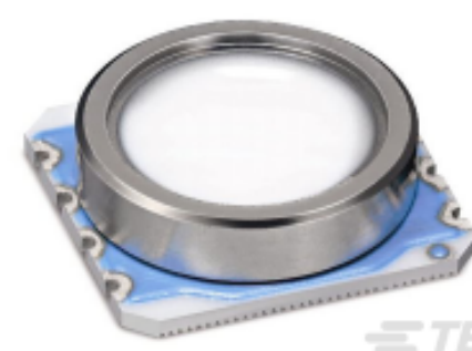
TE Part # MS580305BA01-00 MS5803-05BA 5BAR WHITE GEL TUBE