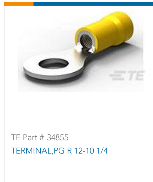
TE Part # 34855 TERMINAL,PG R 12-10 1/4