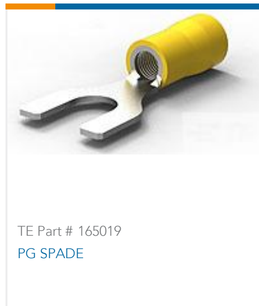
TE Part # 165019 PG SPADE