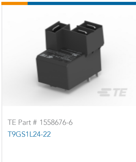
TE Part # 1558676-6 T9GS1L24-22