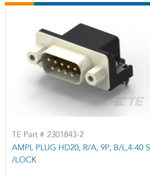
TE Part # 2301843-2 AMPL PLUG HD20, R/A, 9P, B/L,4-40 S /LOCK