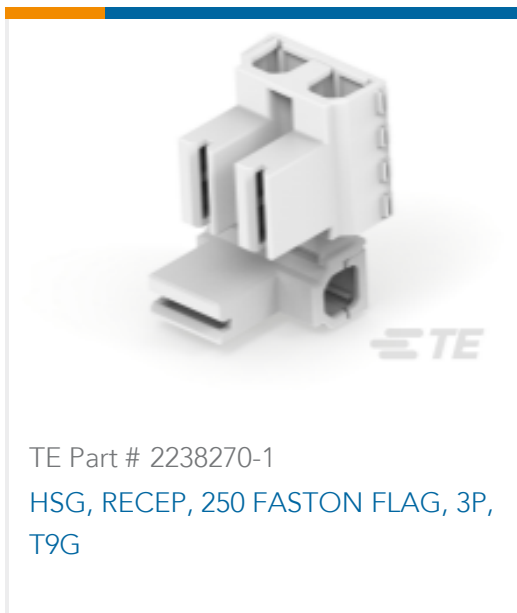
TE Part # 2238270-1 HSG, RECEP, 250 FASTON FLAG, 3P, T9G