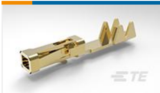
TE Part #487406-2 FFC RCPT CONT SP 30AU RL