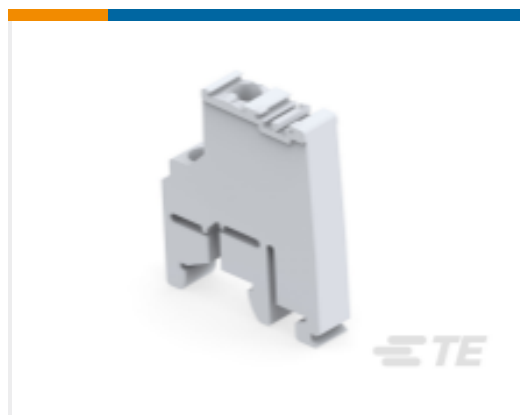
TE Part #1SNA114836R0000 BAMH