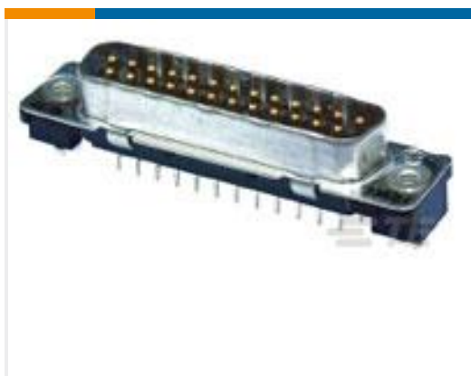
TE Part #2-747704-0 25 PLUG SP/FMS BRDLK