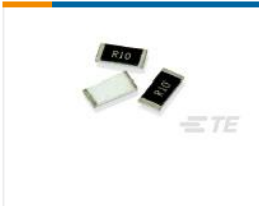
TE Part #2-1622824-8 RL73H 3A R27 1% 4K RL