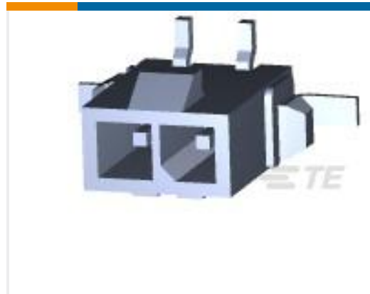
TE Part #2-1445087-2 MICRO MNL HDR ASSY S/ROW AU LF