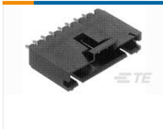
TE Part #103670-1 02 MTE HDR SRST LATCH W/HLDWN