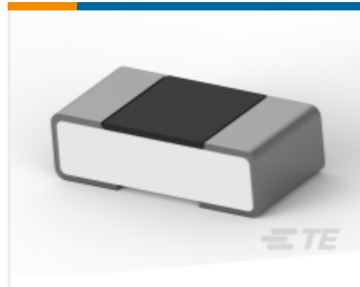
TE Part #5-2176362-3 RQ 0402 140R 0.1% 10PPM 5K RL