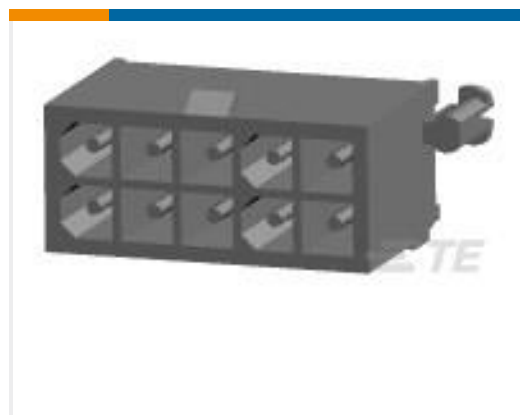
TE Part #770743-1 10P MINI UMNL HDR ASSY D/R VRT