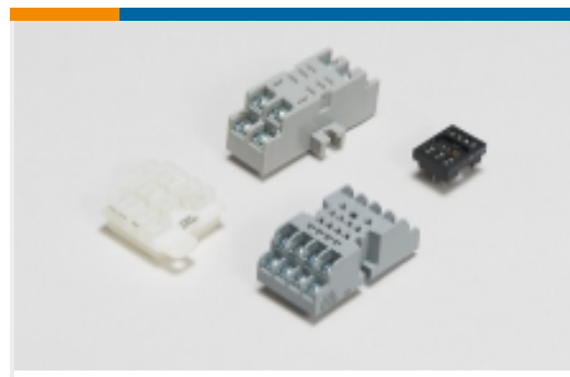
Relay Accessories, Sockets & Clips(30)