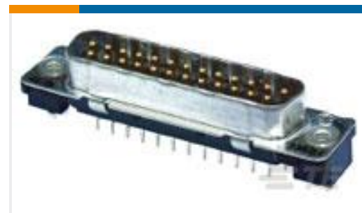
TE Part #1-5747871-6 09 PLUG SP/FMS SCRLK