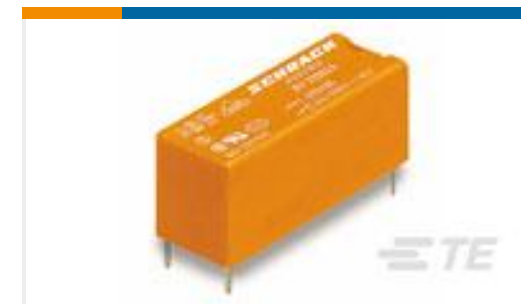
TE Part #5-1393224-7 RY212018