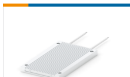
TE Part #2-2176250-1 TJT 500W 2K2 5%