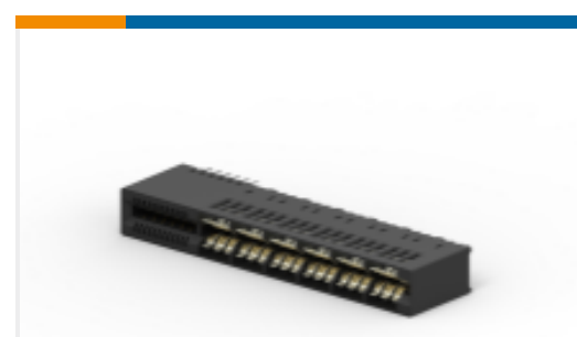
TE Part #2214913-4 MULTI-BEAM CE 2X6 P + 2X12 S VERTICAL