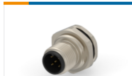
TE Part #T4171010005-001 M12,REAR MOUNTING,MALE,A,5P,0.2 M WIRE