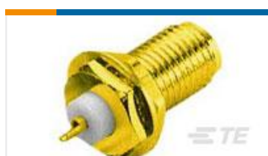
TE Part #1-1478966-0 SMA B/HD SKT RCPT GSS