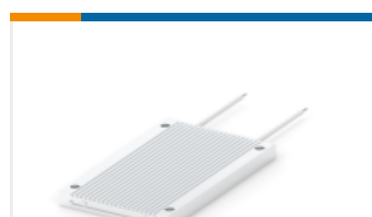
TE Part #2176250-9 TJT 500W 22R 5%