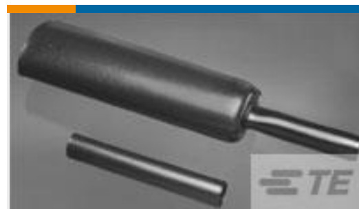
TE Part #782628-000 RMW-25/8-1200/ADH-0